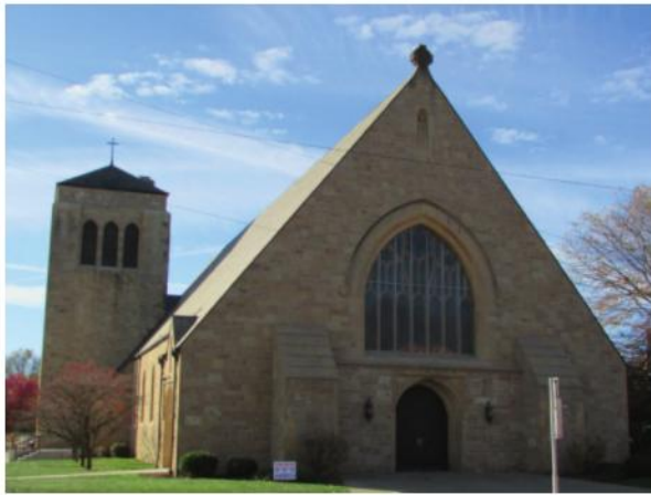
St. Paul Parish 935 East State Street Salem, Ohio Established 1881