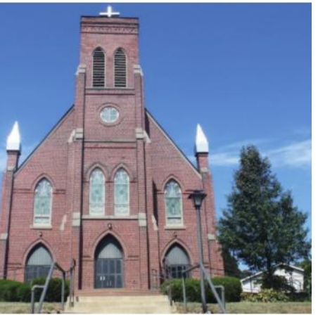
St. Patrick Parish 167 West Main Street Leetonia, Ohio Established 1861