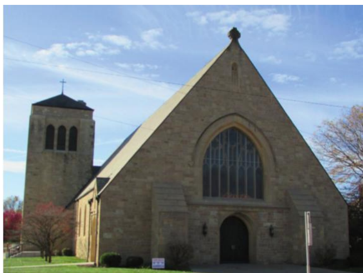
St. Paul Parish 935 East State Street Salem, Ohio Established 1881