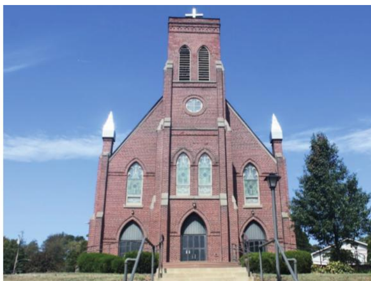
St. Patrick Parish 167 West Main Street Leetonia, Ohio Established 1861