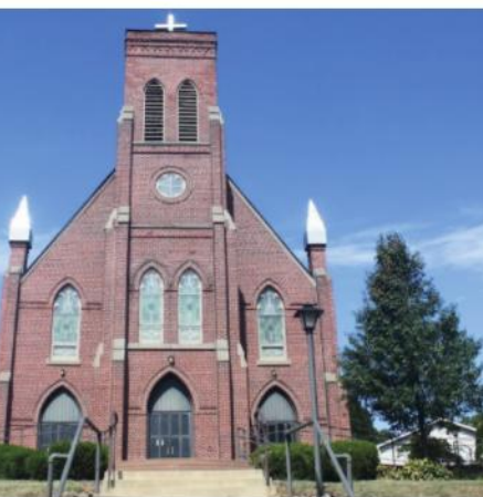
St. Patrick Parish 167 West Main Street Leetonia, Ohio Established 1861