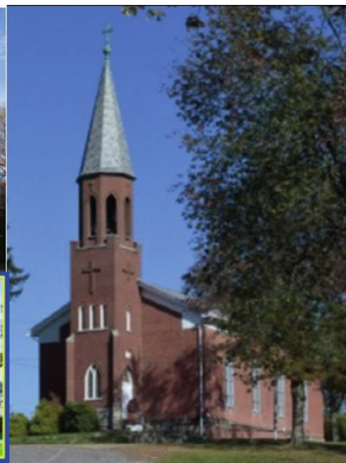
St. Philip Neri Parish 11328 Gavers Rd Hanoverton, Ohio Established 1817