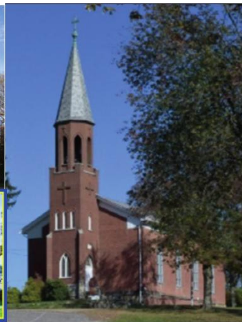
St. Philip Neri Parish 11328 Gavers Rd Hanoverton, Ohio Established 1817