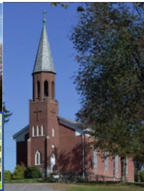
St. Philip Neri Parish 11297 Gavers Rd Hanoverton, Ohio Established 1817