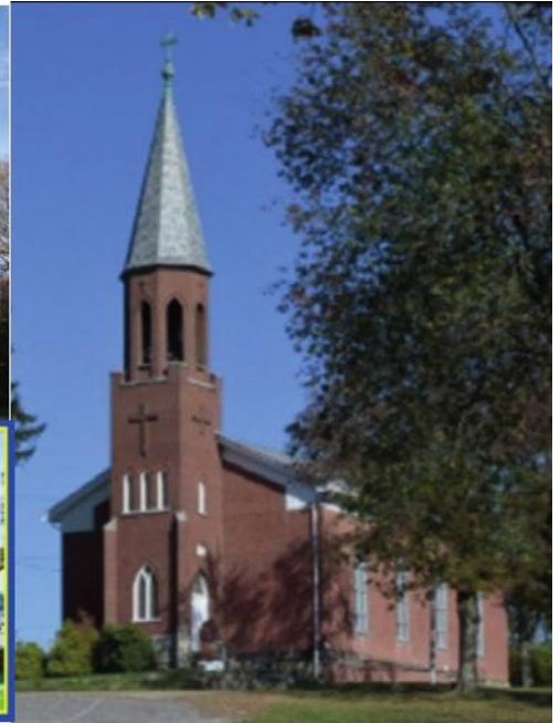
St. Philip Neri Parish 11297 Gavers Rd Hanoverton, Ohio Established 1817