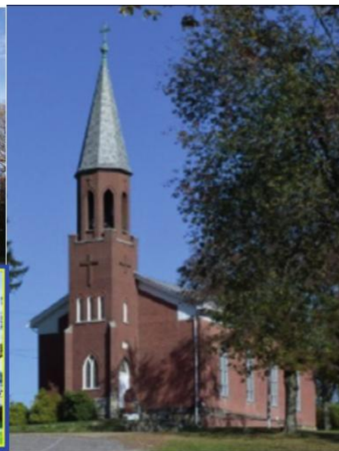
St. Philip Neri Parish 11297 Gavers Rd. Hanoverton, OH 44423 Established 1817