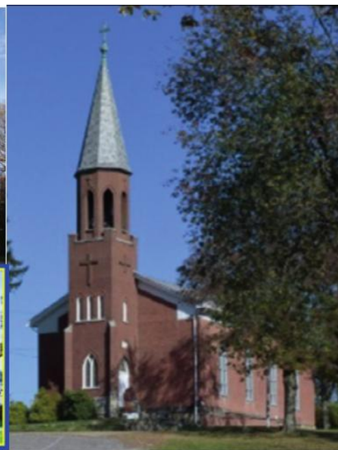
St. Philip Neri Parish 11297 Gavers Rd. Hanoverton, OH 44423 Established 1817