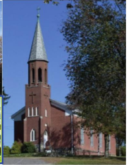
St. Philip Neri Parish 11328 Gavers Rd. Hanoverton, OH 44423 Established 1817