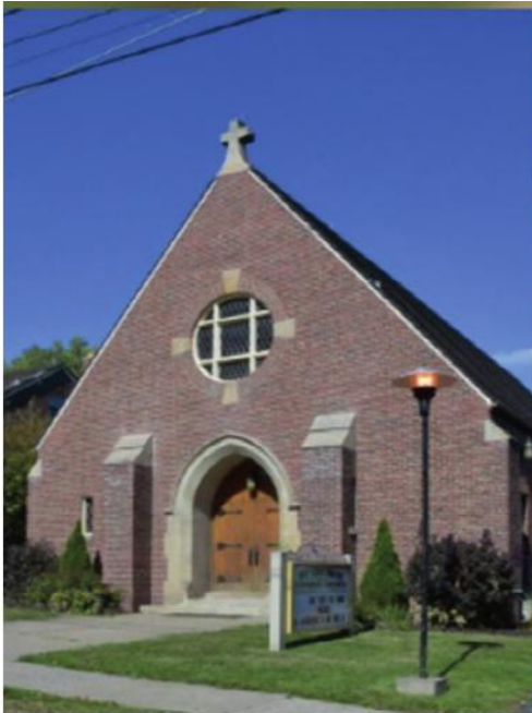
St. George Parish 271 West Chestnut St. Lisbon, OH 44432 Established 1820