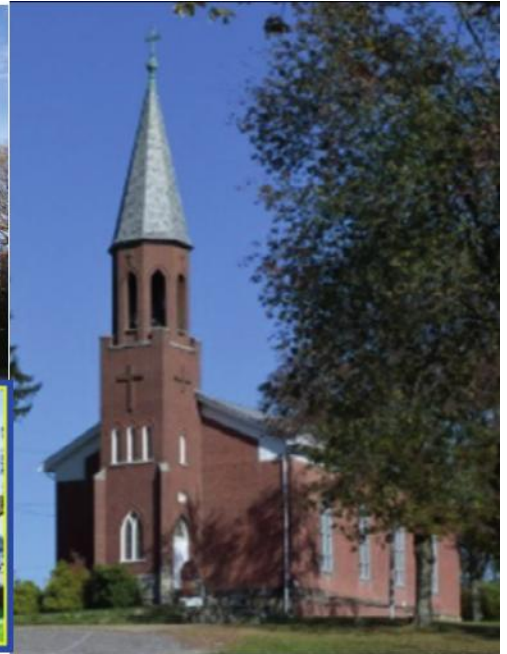
St. Philip Neri Parish 11328 Gavers Rd. Hanoverton, OH 44423 Established 1817