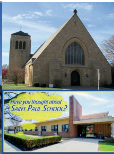
St. Paul Parish 935 East State St. Salem, OH 44460 Established 1881