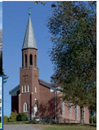
St. Philip Neri Parish 11328 Gavers Rd. Hanoverton, OH 44423 Established 1817