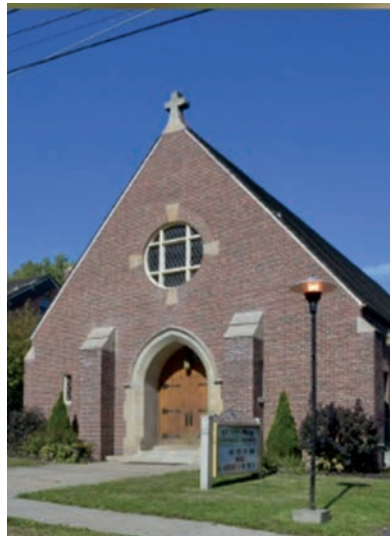
St. George Parish 271 West Chestnut St. Lisbon, OH 44432 Established 1820