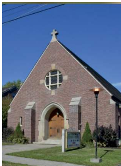
St. George Parish 271 West Chestnut St. Lisbon, OH 44432 Established 1820