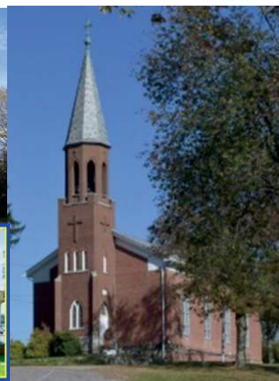
St. Philip Neri Parish 11328 Gavers Rd. Hanoverton, OH 44423 Established 1817