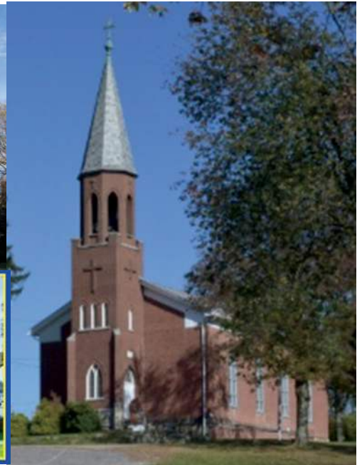
St. Philip Neri Parish 11328 Gavers Rd. Hanoverton, OH 44423 Established 1817

St. George in Lisbon, St. Paul in Salem and St. Philip Neri in Dungannon/Hanoverton are parishes of the Roman Catholic Diocese of Youngstown, Ohio. We are called by baptism to continue Christ's mission through education, example and service as we celebrate Jesus' presence in our lives. We are nourished by Word, Worship, and Sacrament. In the Spirit of Jesus, we dedicate ourselves to minister through the sharing of our time, talent and treasure.