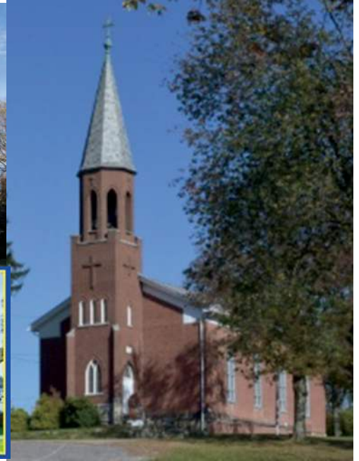
St. Philip Neri Parish 11328 Gavers Rd. Hanoverton, OH 44423 Established 1817

St. George in Lisbon, St. Paul in Salem and St. Philip Neri in Dungannon/Hanoverton are parishes of the Roman Catholic Diocese of Youngstown, Ohio. We are called by baptism to continue Christ's mission through education, example and service as we celebrate Jesus' presence in our lives. We are nourished by Word, Worship, and Sacrament. In the Spirit of Jesus, we dedicate ourselves to minister through the sharing of our time, talent and treasure.