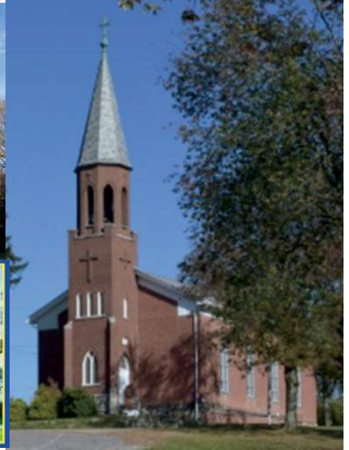
St. Philip Neri Parish 11328 Gavers Rd. Hanoverton, OH 44423 Established 1817

St. George in Lisbon, St. Paul in Salem and St. Philip Neri in Dungannon/Hanoverton are parishes of the Roman Catholic Diocese of Youngstown, Ohio. We are called by baptism to continue Christ's mission through education, example and service as we celebrate Jesus' presence in our lives. We are nourished by Word, Worship, and Sacrament. In the Spirit of Jesus, we dedicate ourselves to minister through the sharing of our time, talent and treasure.