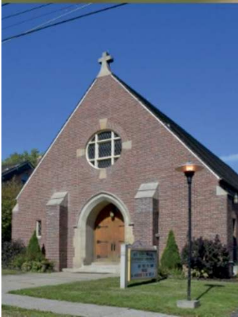
St. George Parish 271 West Chestnut St. Lisbon, OH 44432 Established 1820